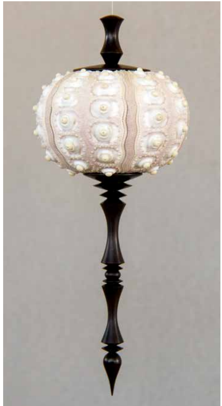
I find the turning characteristics, the ability to hold detail, and the pleasing look of African blackwood make it the best choice for finials

Blackwood, properly turned and sanded, really doesn't require a finish since it polishes up beautifully. When I feel that a higher gloss is appropriate, I use a product called EEE-Ultra Shine made by U-Beaut in Australia. I believe it is really is a wax infused with tripoli abrasive. It takes the sanding to the next step and leaves a high-gloss shine. Since the finial will rarely, if ever, be touched, I'm unconcerned about a durable finish and this finish serves very nicely to punch up the looks. At completion, the spindle, a.k.a. finial, is parted off again, supporting it with your one hand to prevent it from sailing into space and being damaged on landing. Holding it with your one hand loosely will capture it safely once it is parted off. I find that V-cuts with a skew chisel are the best way to part off a finial. Give finials a try with less expensive stock as you learn. You won't be able to achieve the same thin sections or hold the same crisp detail but you'll be able to learn less expensively as you refine your technique. Best of luck as you progress.