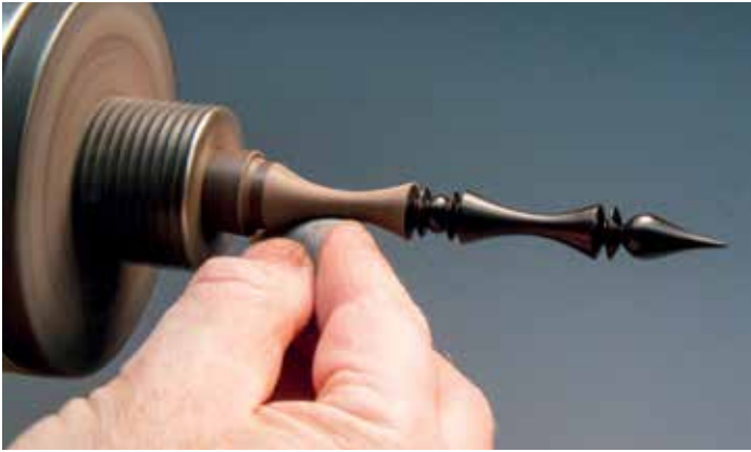
Like the very thin, long stem goblet shaft, you work in sections completely finishing each short section and then moving on to the left