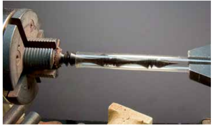
If you aren't comfortable "catching" your finial as you part it off, use this trick to safely enclose and catch your prize as you separate it

wasted material. Blackwood has exquisite colourations and grain when closely examined. I love that but avoid it like the plague. I want perfectly straight grain that runs the full length of my intended finial. That will turn well and have great strength in the slender areas. On the rare occasion that I use a different wood, I follow the same selection process. I have used various rosewoods a few times. The straightness of the grain, especially in the thinner shaft areas, trumps all the other potential grain beauty. The finial turning is a single-ended mount and turned from the thin end in. I usually turn the selected blank between centres to round the stock and put a mounting tenon on one end. Once accomplished, the finial blank is mounted from that tenon and the tailstock is removed. The unsupported end will be the most delicate part so the turning begins there and progresses toward the tenon. All sanding and finishing is progressively done in short lengths from the thin, unsupported end towards the headstock. It is turned, sanded, and finished if desired in short lengths, much like the technique used for making long-stem goblets.