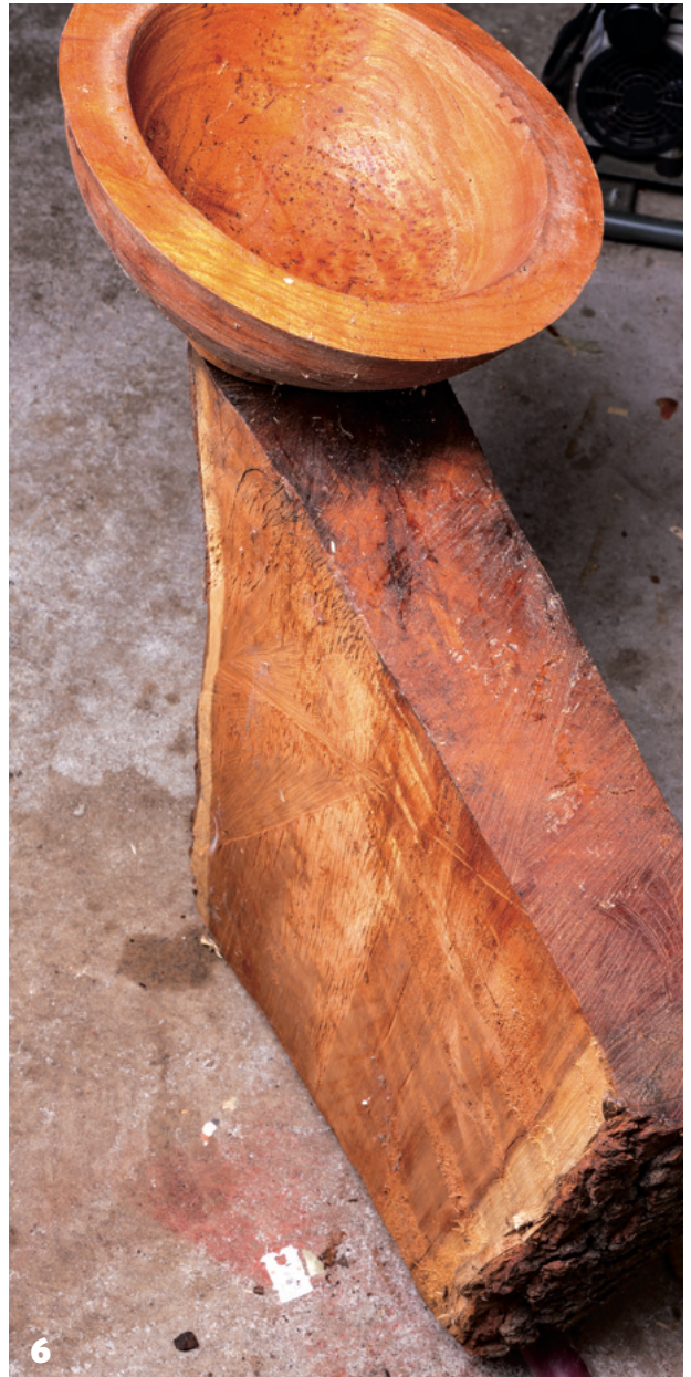
3 I buy my Anchorseal from my club. Club bulk buys help with the cost and a big box five-gallon bucket makes for easy storage and use 4 Some Norfolk Island pine, end coated for storage. Notice the wood kept off the ground on patio blocks. Also, a tarp to cover it is wise 5 Coating the end grain is key to minimising drying loss. Household latex paint will also work to slow moisture loss 6 Whenever in doubt, liberally coat any green wood blanks or in-process turnings. It will not hurt anything if not needed