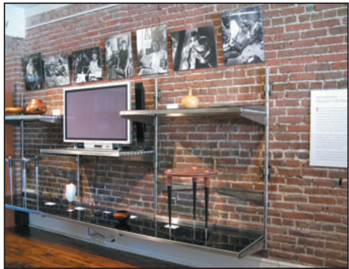
Fig. 13. The video playback area is equally as decorated with fine woodturned art.