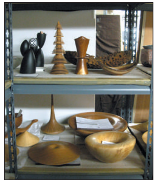
Fig. 20. In addition to the permanent collection, there is an impressive assortment of works by various artists that are offered in the sales area.