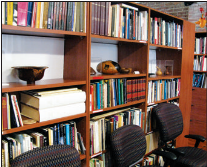
Fig. 10. Adjacent to the featured artist exhibit is the library and study area.