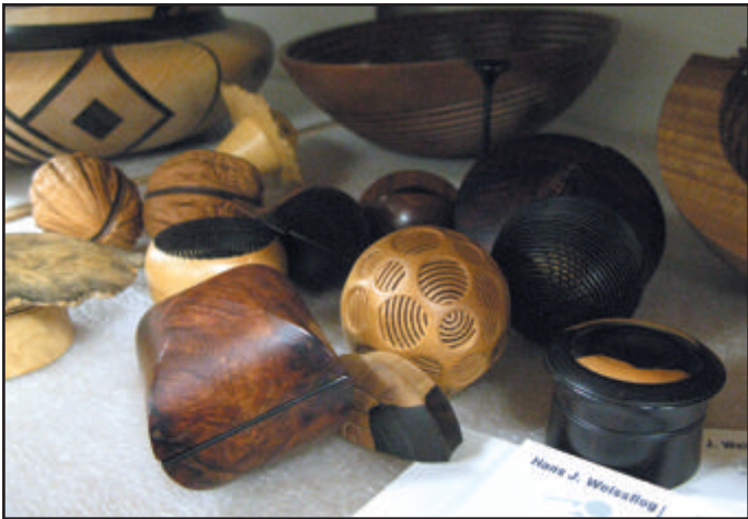
Fig. 16. The collection often includes work that spans an artist's career from early to current.