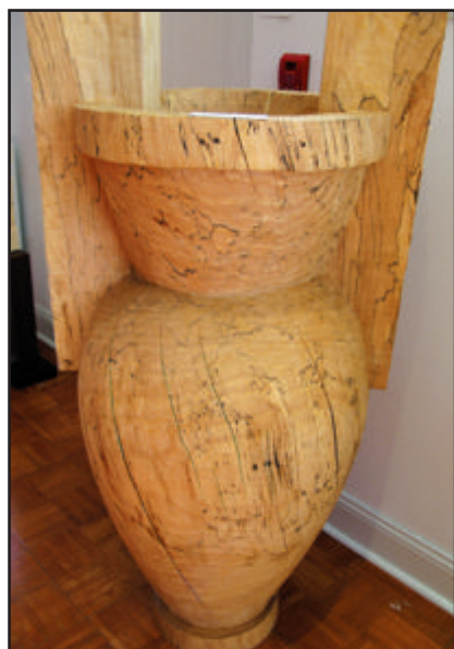
Fig. 5. The turnings range in size from miniatures to relatively large turnings.