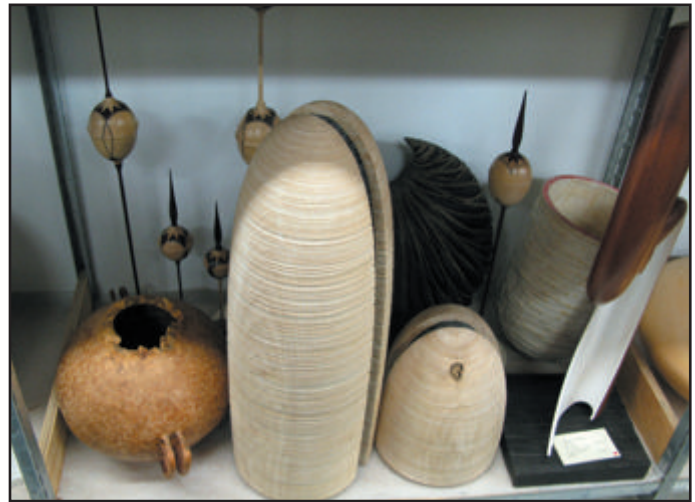
Fig. 19. More of the depth and breadth of the Wood Turning Center's collection.