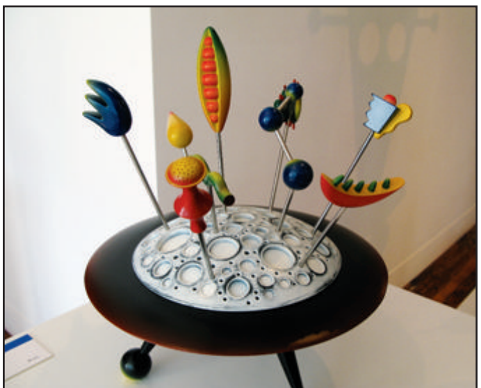
Fig. 8. The featured artist display—Steve Madsen shown here—contains specially selected works.