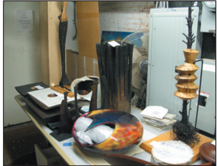
Fig. 18. The variety spans a wide array of techniques.