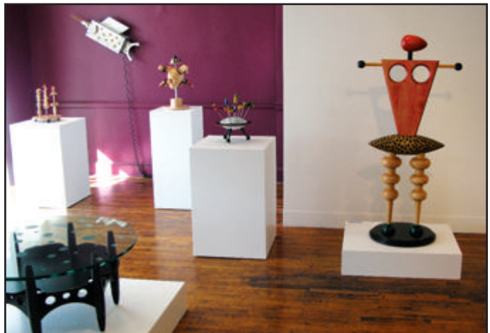
Fig. 7. The next rooms contain a rotating featured artist display.