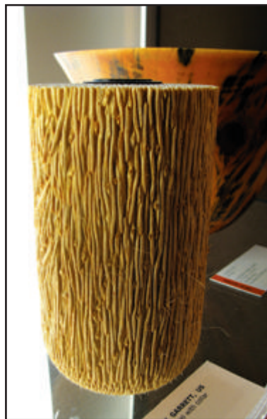
Fig. 4. It is quite an honor to be included in the window display at the center.