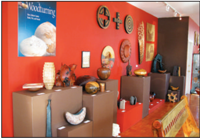
Fig. 3. The foyer has an impressive display of turnings, as well as turnings that are for sale.