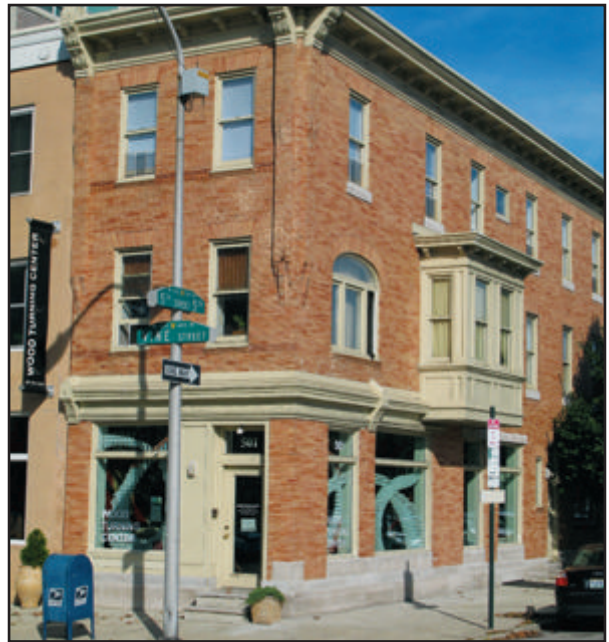
Fig. 1. The Wood Turning Center is in an unassuming building on the corner of Fifth and Vine in Philadelphia.

If you are ever in Philadelphia, make sure you have time available to visit the Wood Turning Center. These photos don't do it justice. The history of the craft and art of wood is incredible and right before your eyes. In the interim, you can find more about the Wood Turning Center and enjoy it remotely by visiting them at www.woodturningcenter.org .