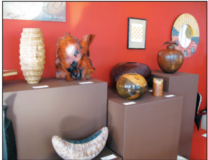
Fig. 6. The displays are visible from the street through the windows that run along the entire length of the building.