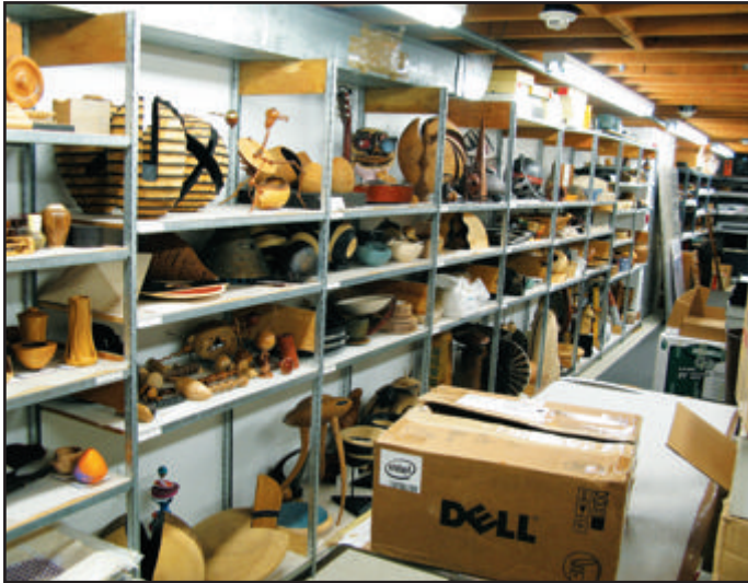
Fig. 15. The Center has an extensive collection of wood art from the earliest days through the modern.