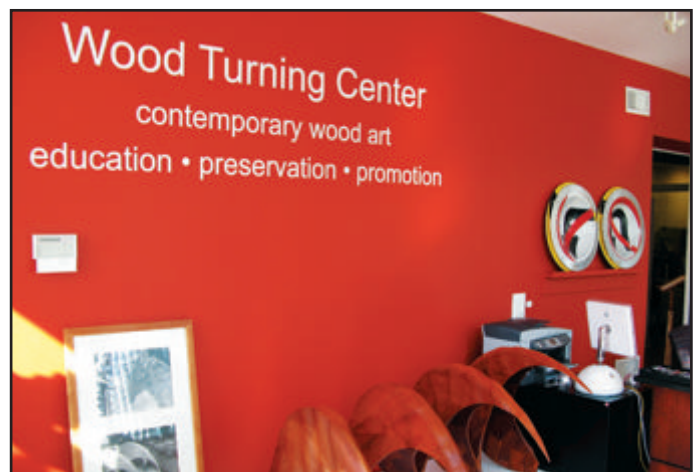
Fig. 2. It has simple, straightforward goals of the education, preservation, and promotion of contemporary wood art.