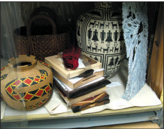
Fig. 17. The Wood Turning Center's collection is rich with the history of woodturning.