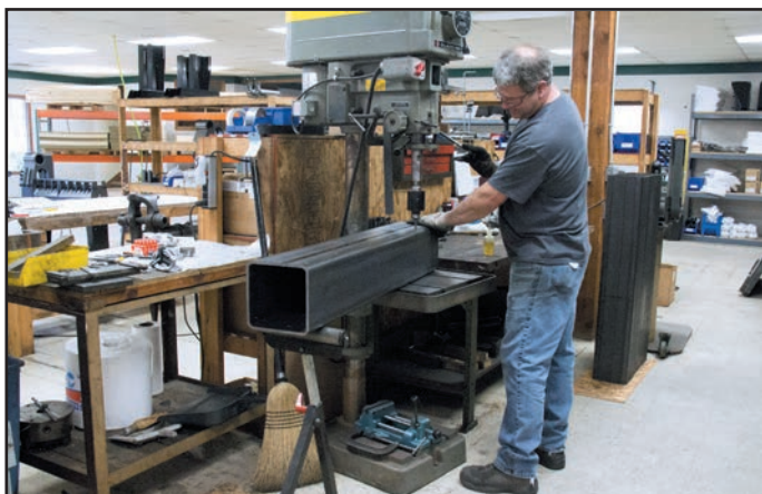
Fig. 4. Other than powder coating and a few specialty operations, everything is done by hand in small production batches. The entire production process flows based on the “small batch, built to order” concept.