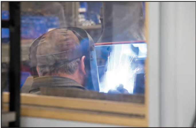
Fig. 7. There is a three-man crew on the shop floor, but each person has his own area of expertise. They are all cross-trained, but still gravitate toward their favorite tasks. Here, the frame components are being welded.