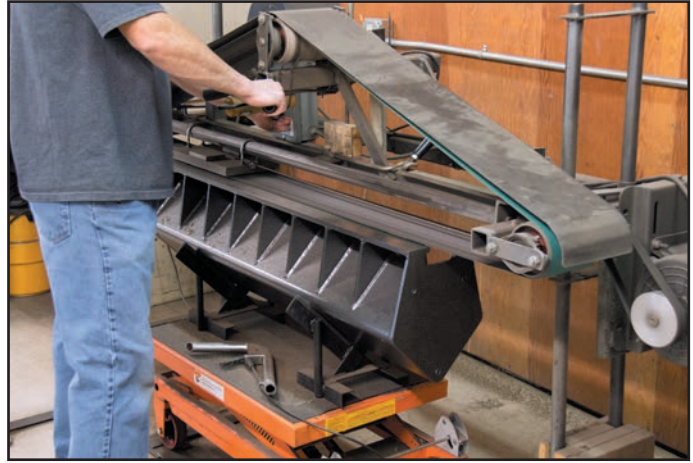
Fig. 9. Here, the lathe bedways are trued using a task built belt sander with a traveling pressure platen.