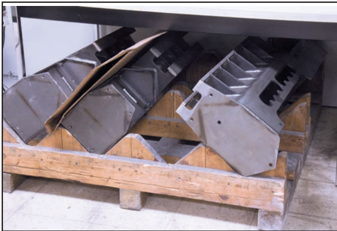
Fig. 13. After the lathe beds are welded and the stainless steel ways are attached, they go out for painting. All the painting, except for the tool rest product line, is done by a local specialty painter.