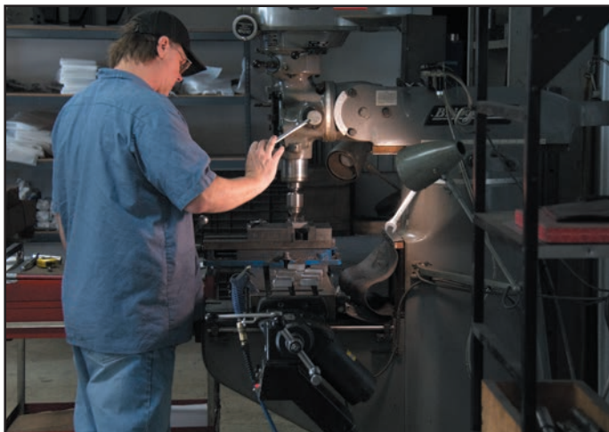
Fig. 3. Other than a small space for offices, the rest of the building houses a standard machine tool shop, complete with nearly everything needed to make most of the entire Robust Tools lathe family.