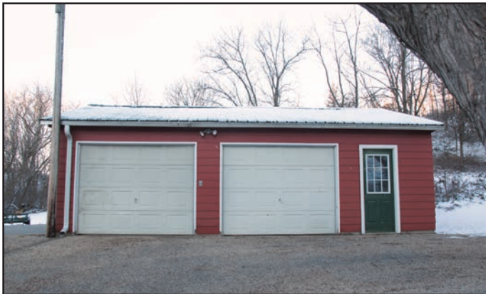
Fig. 14. The original home of Robust Tools was a 900-square-foot, two-car garage with sufficient room to build only one lathe at a time. Floor space was cramped and production machine tools were limited.