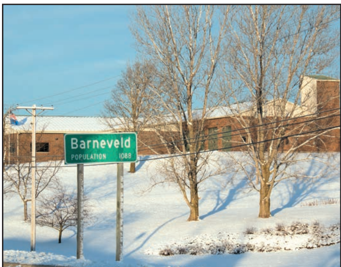
Fig. 1. Located in Barneveld, Wisconsin (a small rural town of 1,100), Robust Tools is unique; most of the residents of the town commute the thirty miles to Madison for employment.

The lathes in the Robust Tools product line all carry a seven-year warranty. Their lathes and tool rests are not only sold direct, but they are also sold through a network of woodturning professionals and through the Woodcraft website. With a 75/25 split between lathes and tool rests, both continue to build a following among the woodturning community. You can see all the Robust Tools products on their website at www.turnrobust.com .