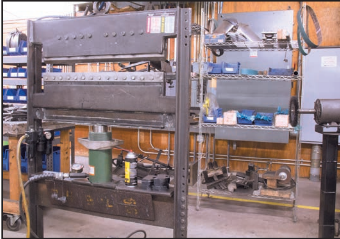
Fig. 12. Many of the product components require bending or welding or both. There is a host of welding jigs and fixtures along with shop-built bending equipment and tools to simplify the task.