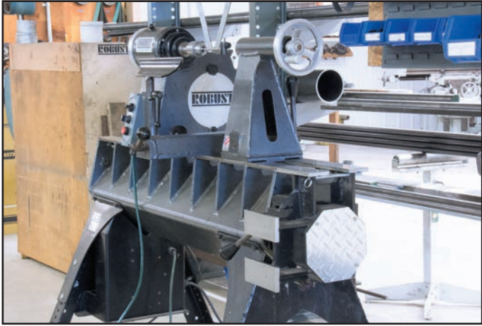
Fig. 6. Respectfully called “old number one,” the first production design prototype machine sits prominently on the shop floor. It is still providing service as a test bed for design ideas; it runs nicely and can still turn pieces.