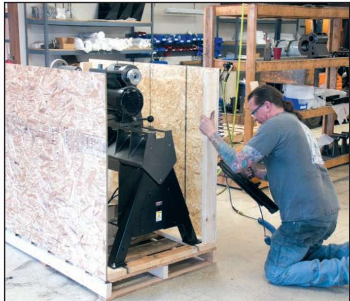
Fig. 16. Each shipping crate is constructed around the lathe. The skids, side panels, and bracing are designed to be prefabricated and stocked as component parts in inventory. Shipping is another designed assembly process.