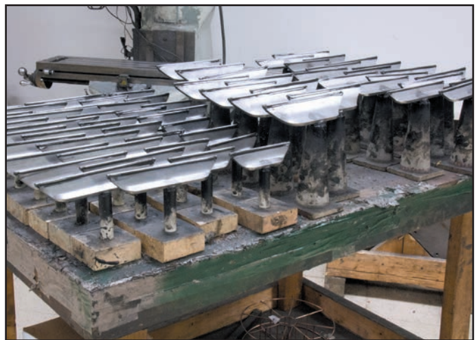
Fig. 11. Similar to the lathes, tool rest production runs in batches; these tool rests are being readied for painting. The Robust Tools tool rests feature a hardened steel top rod to provide long life with minimal wear.