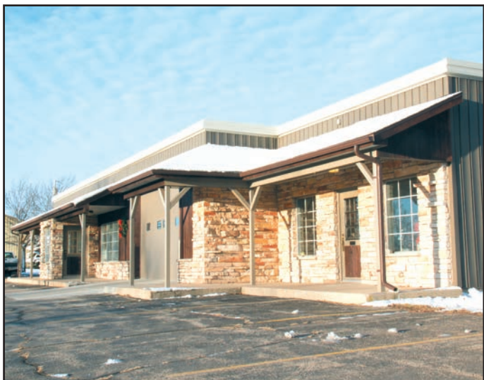
Fig. 2. Robust Tools is located in the heart of “downtown” in a building that once housed a small grocery store. It is literally in the shadow of the famous Barneveld water tower.