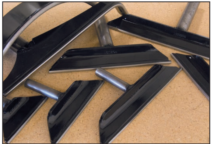
Fig. 10. In addition to the various lathes produced by Robust Tools, there is an extensive selection of tool rests. A vast array of sizes, shapes, tool post diameters, and lengths are available for current- and past-model lathes.