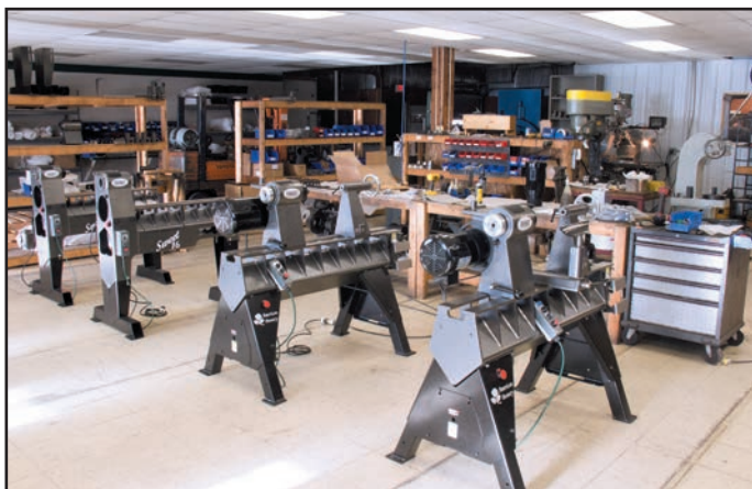
Fig. 5. Each lathe being assembled is already sold and belongs to someone. The assembly and test area is in the middle of the building right in front of the old grocery store windows.