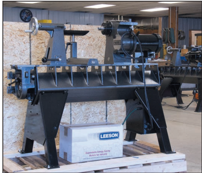
Fig. 15. Once lagged to the skid and with the rest of the accessories fastened on board, the lathe will be shipped by common carrier to the new owner. Lathes are usually shipped once a week.