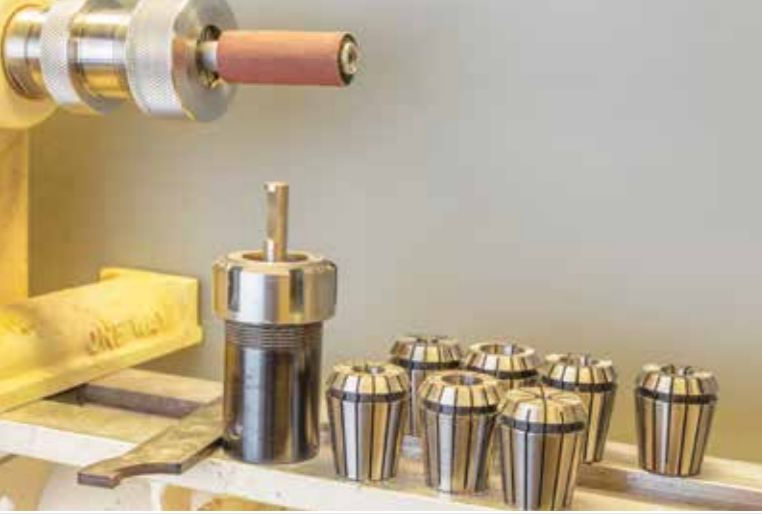
For safety's sake, drill chucks in the headstock are not appropriate. Use a threaded-on fastening system like a chuck or collet