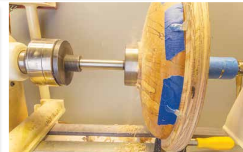
In this drilling, the bit rotates but the work advances. You have the resolution of the tailstock quill and the force of the handwheel gearing