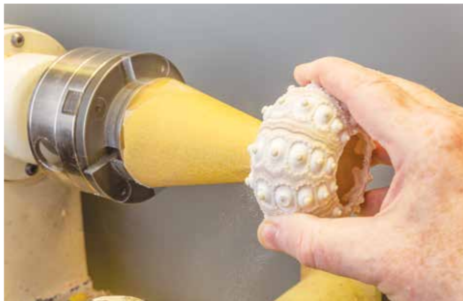
Home-made drum sanders can be any shape needed. Here a tapered block with PSA sandpaper rounds Urchin holes

While my lathe may not oscillate as my oscillating spindle sander does, it can be made to effectively perform the same function. There is a wide range of sanding drums available for your drill press, hand drill, thickness sander and powered flex shaft equipment. All of these can be easily clamped or threaded into your headstock to bring them to bear on work presented to them. However, you can easily make your own sanding drums, whether straight, tapered or any other shape you wish. Because you can easily turn your own diameter, you can have a large array of them available that wouldn't be in the usual spindle sander range. With these easily made, low-cost spindles, you can have different grits ready to use with minimal cost and quick changeover. The same table used for supporting your stock for presentation to the disc sander can be used for the spindle sander with a simple modification.