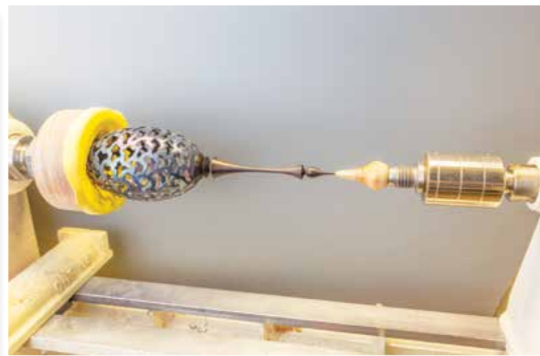
A nicer gluing clamp is hard to find. A pierced and painted goose egg has the finial glued in place and clamped until cured