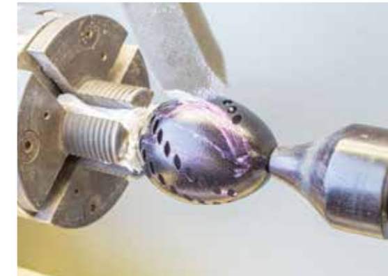
Capable of an incredibly light touch, here a pierced chicken egg is painted and rotated using the handwheel

leave your work mounted, rotate it to the best working position, lock the headstock and work on your piece. That can be painting, piercing, pyrography, carving or any other alteration. Reposition as needed. Of course, you can mount a carver's screw to a fixture. You can even mount your carving vice to your lathe bed as shown in the workholding series. How better to hold things than with your lathe? It is at the correct height, sturdily mounted and has a secure base. You have it there already. Other than tying the lathe up when it might be needed for turning, it is the greatest multitasking piece of equipment you own.