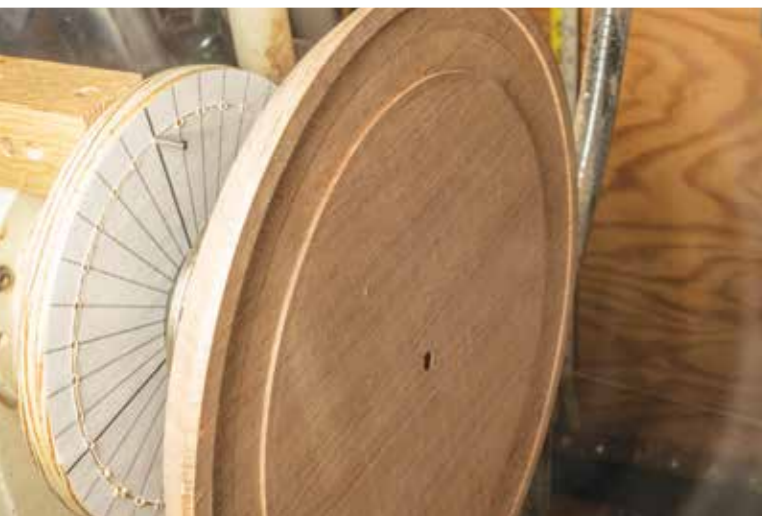
Indexed assembly, drilling, marking, slotting or whatever is easily done on the lathe. Shop-bought or home-made indexing works well

also use the lathe. You might need to make some platens to distribute the force across the surface appropriately but that is quick work. Often just placing your stock across the jaws of a chuck and a board on the face of the tailcentre shaft will be sufficient. You'll have a clamp that you can exert large clamp load with that has an open throat nearly as large as your centre to centre distance. You can also add outrigger clamps of the standard kind if you have the need to add clamp load on the perimeter.