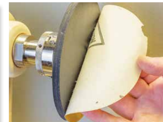
With PSA abrasive sheets you can easily change grits quickly without ruining the sheet