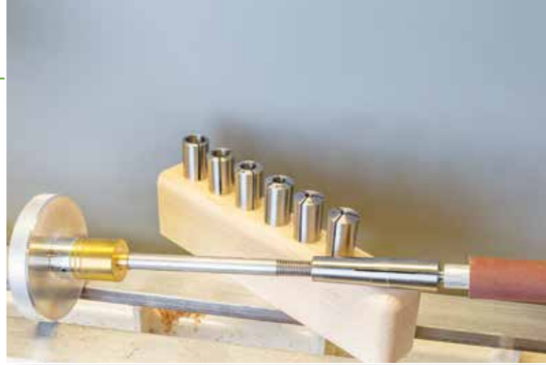
For those unfamiliar with a collet and drawbar, the drawbar pulls the collet in to close it and holds it there clamped