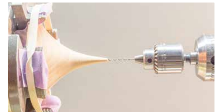
The lathe is a true multitasking piece of equipment with far-reaching capabilities. You can usually figure a way to get it done

With all of the non-woodturning functions your lathe can perform in the workshop, you might think seriously before you buy those other pieces of equipment if you currently don't own them. If you already have them, perhaps getting rid of a few will open up more space. The lathe itself does a wonderful job at what it was designed to do. Having done that, it