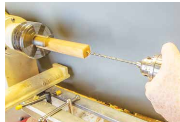
The drill depth is limited only by the drill length when using a lathe. It is important to hold the drill chuck on retraction

in and out using the tailstock. You also have use of the tailstock quill travel if you wish. Don't lose sight that the drill can be placed in the headstock and the stock mounted or supported by the tailstock. The other problem of maximum table clearance is also relieved somewhat by a lathe drilling. The new table clearance is the tip of the drill in the tailstock to the face of your workholding method in the headstock. In a full-size lathe, 915mm, 1,066mm or 1,220mm is common. Even the larger floor-standing, full-sized drill presses don't offer much more. The bench-mounted drill presses are lucky to have 305mm to 510mm which most mini-lathes can provide.