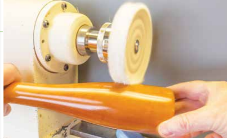
Don't get stuck on what's in the store. You can use wheels of your choice with your own selection of compounds