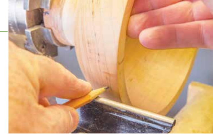
For most turnings, a pencil and a toolrest can tell you all you need to know. The pencil will mark the high spots and not the low

This is the most straightforward of all of the non-turning applications. Once you've got something mounted, why take it off? If you need to paint or spray a finish, you can use your lathe as your rotary worktable. Be safe with ventilation, fume extraction and proper respirator filtering. A variable speed lathe slowed right down works wonderfully for spraying paint or finish. You can control the rotational speed for application but also let it rotate to minimise runs as it dries. Since it is already mounted, why not let it cure there? Even before you get to your finishing, what about after turning enhancements? You can