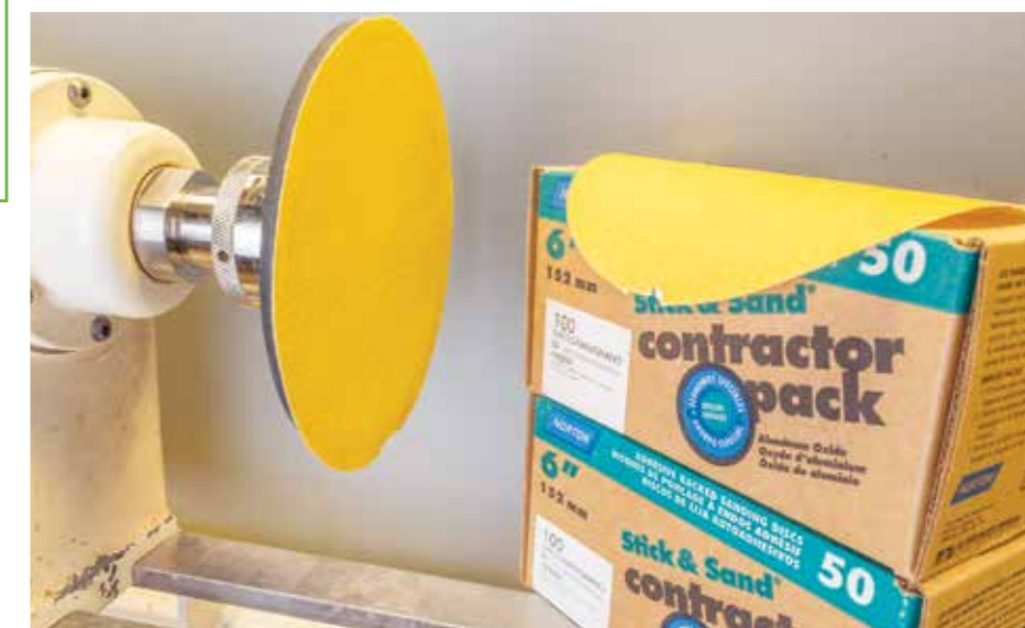
Creating a disc sander is as easy as adding a stiff sanding pad. You can go as large as your swing will allow

of these and not sufficient need of others to add them to your workshop arsenal. Regardless of the reason for their absence, let's look at the best multitasker you have in your workshop – your lathe. Regardless of the size, your lathe can perform the tasks of nearly all of the equipment I've listed. Let's see how.