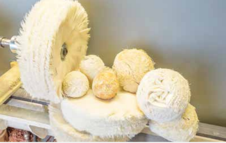
The Beall buffing system includes three buffs for different compounds and has inside buff sets of different sizes